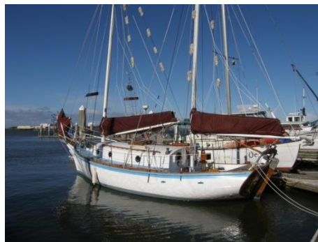
Preparing for the next long voyage

The Golden Rule is the first peace boat. In 1958 four Quaker activists sailed her toward the Marshall Islands in an attempt to halt atmospheric nuclear weapons testing. The US Coast Guard boarded her in Honolulu and arrested her crew, causing a nationwide public outcry.